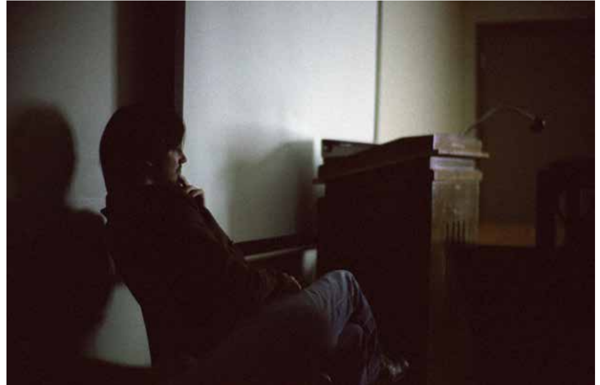
New York, 2006