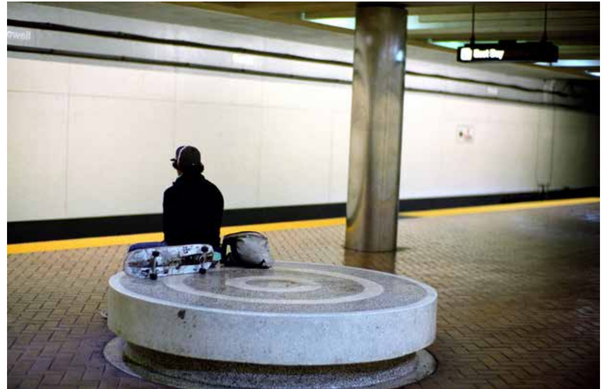
San Francisco, 2007