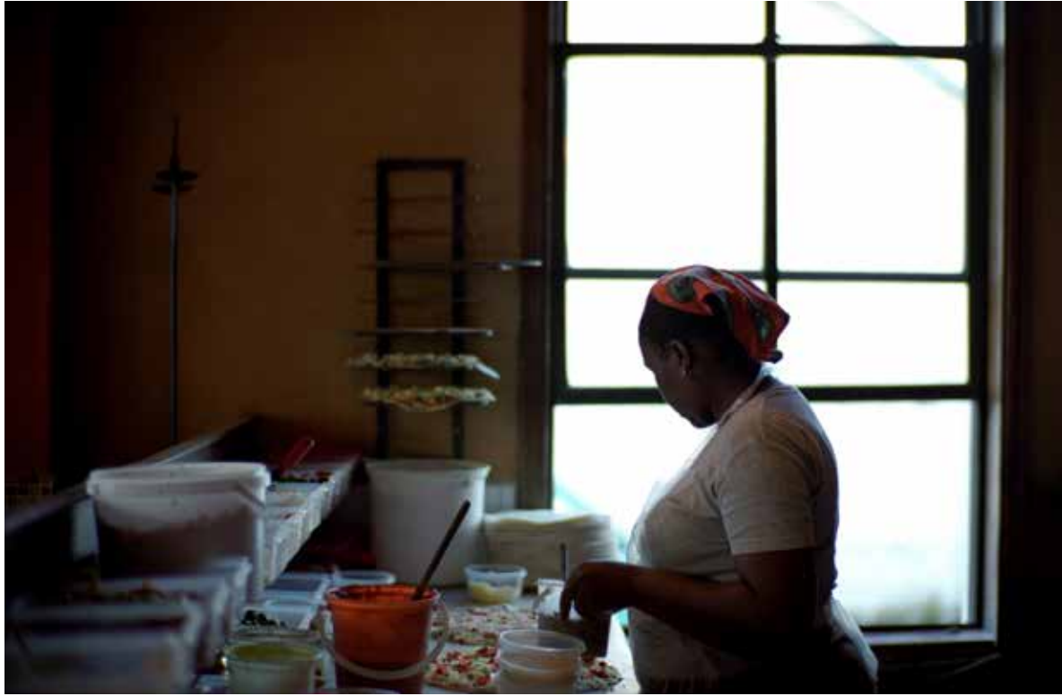
Cape Town, 2008