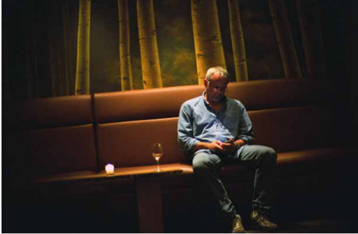
New York, 2004