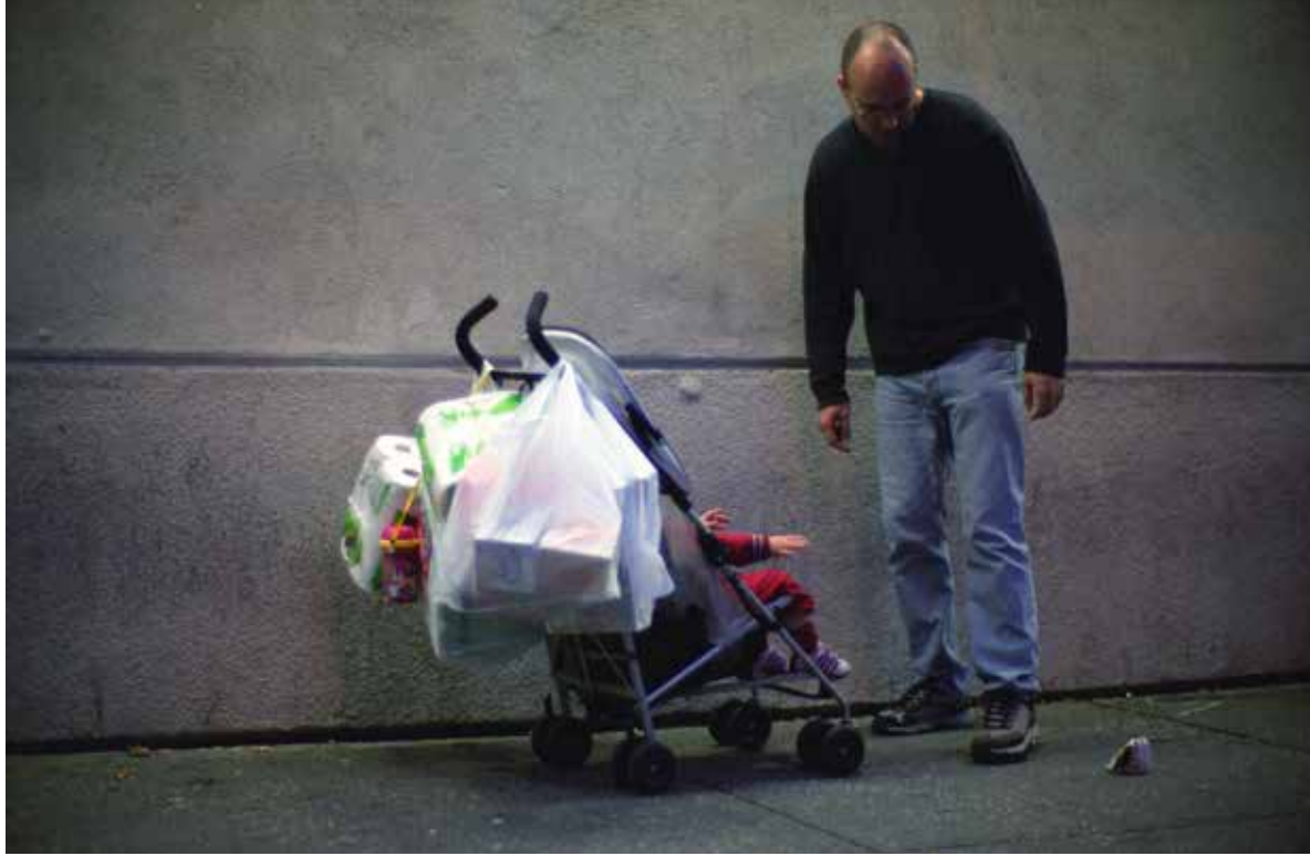
New York, 2004